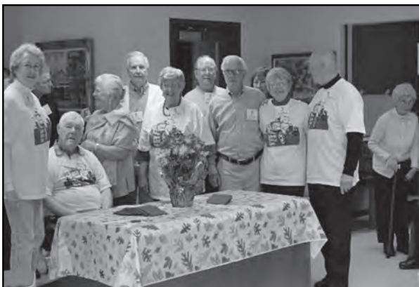
Board members attending the Ice Cream Social celebrating the Historical Society's new History Room