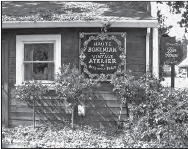
Hen House, building detail as it looks from the south side of the building.