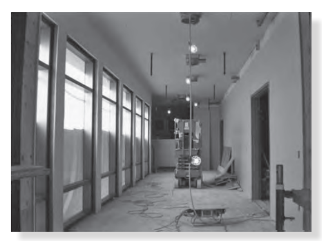
Community Hall Gallery