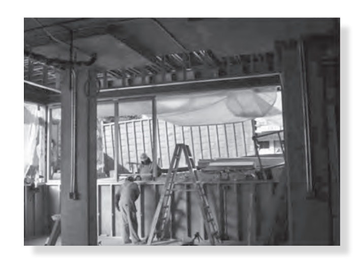
Installing windows in the Bookstore

Construction Activities: The major exterior work continued to be the roof and the windows. Rain slowed the installation of the roof panels, but good weather has allowed progress to be made. The installation of windows is underway. Work on the interior includes sheetrock and finer details on the various systems – electrical, fire safety, HVAC, and plumbing.